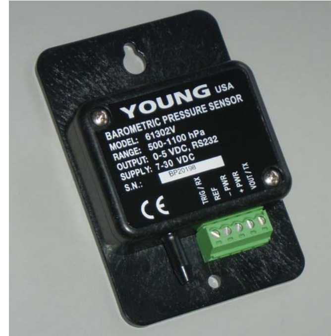
MODEL 61302V BAROMETRIC PRESSURE SENSOR